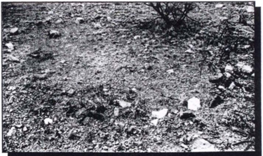
Elliptical rock arrangements on early Piman sites are apparently foundations. Rocks clearly outline this structure excavated by the Arizona State Museum at site AZ EE:2:80 (ASM).

Work has been conducted by crews of professional archaeologists, trained amateur volunteers, and by myself alone. Research efforts for various phases of this project have been supported and sponsored by the Safford District of the Bureau of Land Management; Rio Rico Properties; the Nature Conservancy's Patagonia-Sonoita Creek Preserve; the Education Fund for Research (Department of Anthropology, University of Arizona); Survey and Planning Grants from Arizona State Parks; Mariah Associates, Inc.; and the Arizona Archaeological and Historical Society. Additional data have been obtained during contract