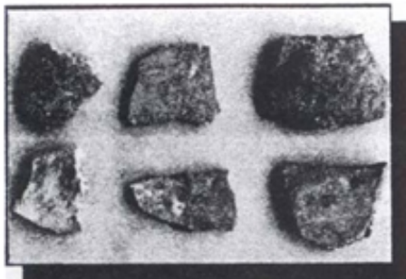
Examples of plainware pottery from Arizona's Sail Pedro Valley, attributed to the Sobaipuri Pima of the late 17th century.

If your name & address label indicates that your Archaeology in Tucson membership has expired please renew promptly to remain eligible for all activities, newsletters, and discounts on T-shirts and Center for Desert Archaeology publications.